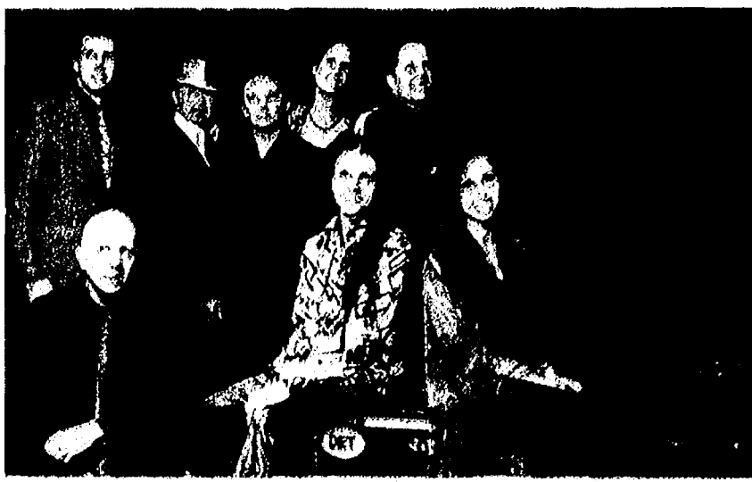
Fifty Amp Fuse is the highlight for Saturday night's dance party.

A complete schedule of events is located on page 10.